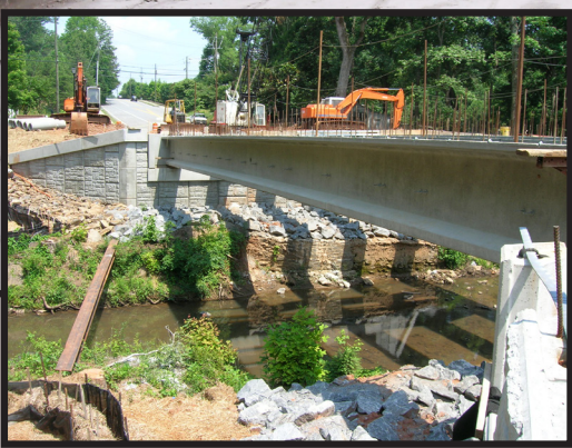
Examples of similar projects.