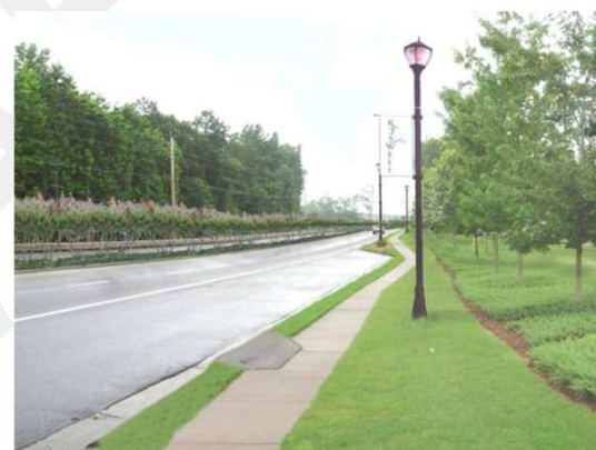
HBR @ Centennial Node – Recommended Streetscape