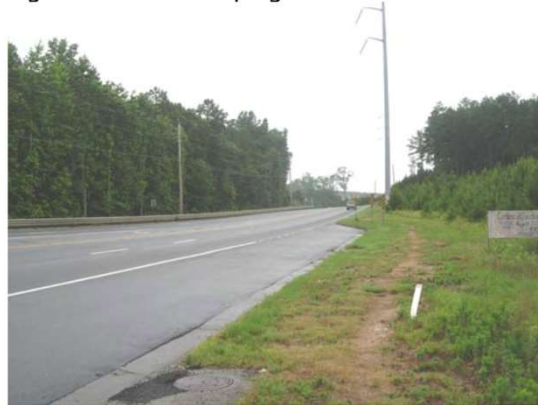
HBR @ Centennial Node – Current Roadway